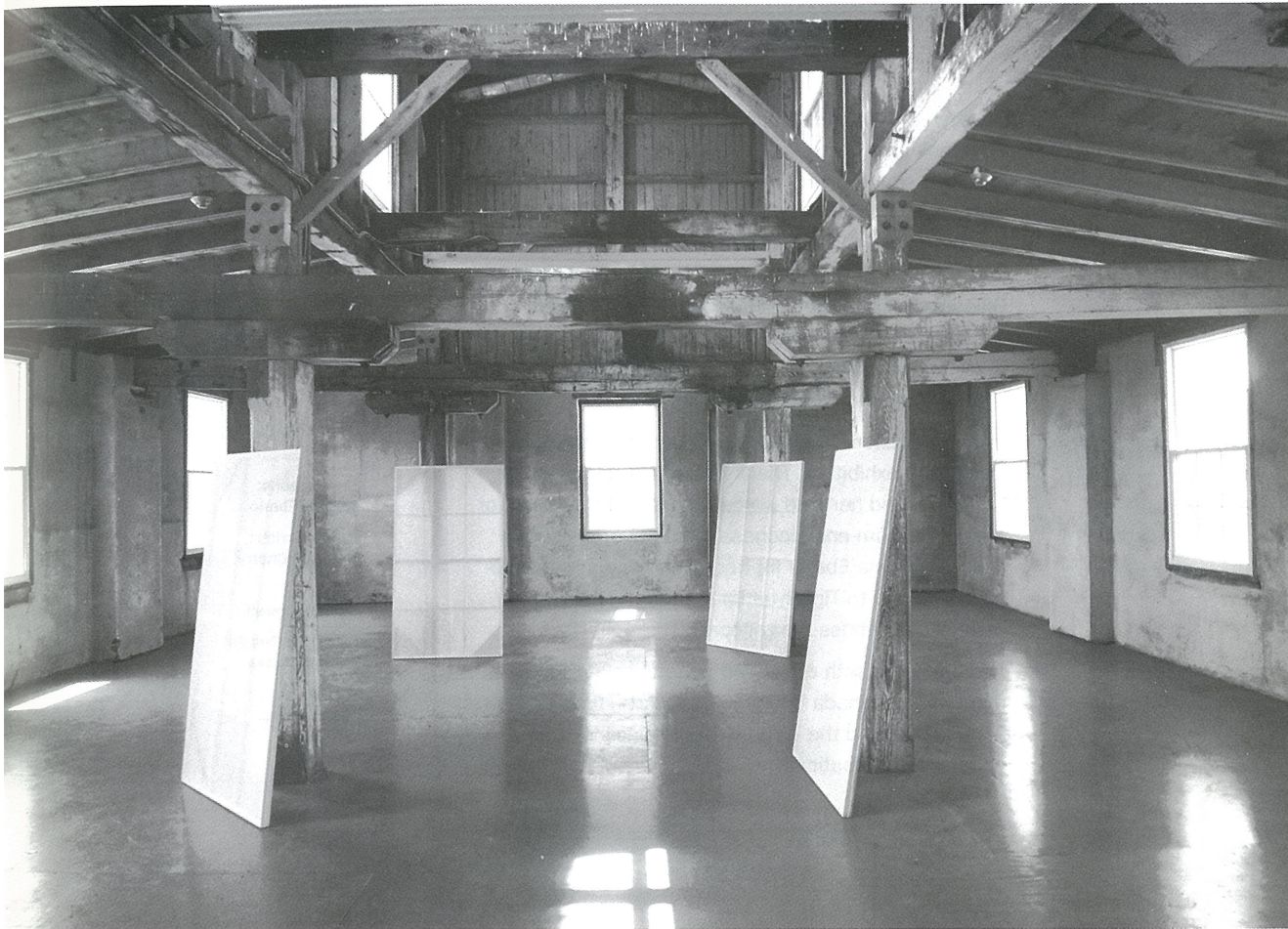
Loft installation, 2011; cotton gauze, thread, wood; 70 x 40 in.