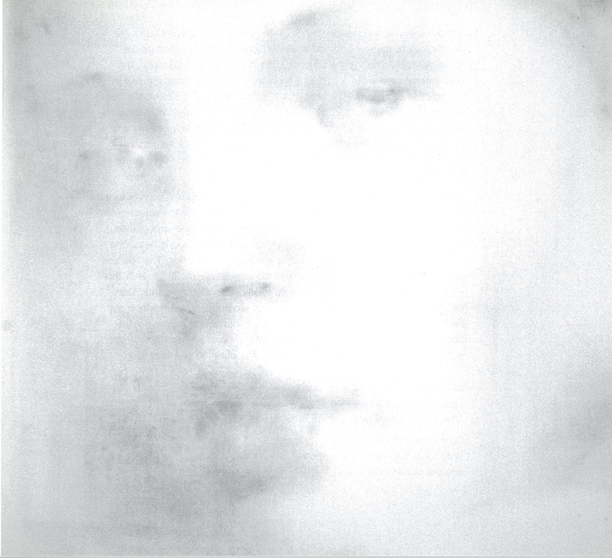
Face 2011.01 (female), 2011; oil on canvas; 50 x 50 in.