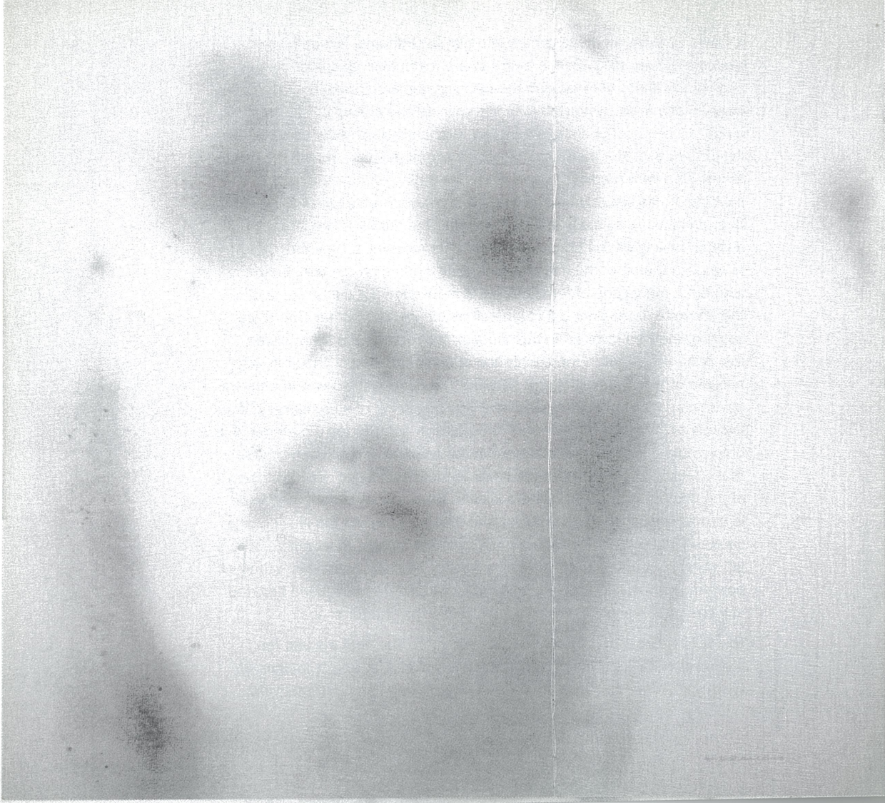
Lost girl 1. , 2011; oil on canvas, cotton gauze, thread; 48 x 48 in.