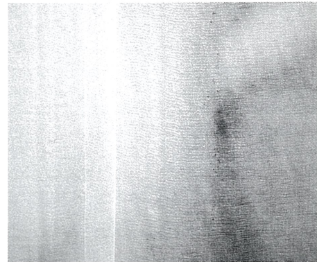
Gauze (detail), 2011; oil on canvas, cotton gauze

These particular works make me think of scenes from the Ingmar Bergman film, Persona . The psyche begins to unravel in this film, as Bergman uses both editing and camera lens to filter out a face, or to splice two not un-similar faces together. In one scene, Liv Ullman's face feels as though it were behind glass. She (Ullman) fades in and out of focus as a young boy struggles to touch her. In Graham's new images, an almost ghostly apparition is before us as this Lost Girl struggles to hide behind, not only the glasses, but also a diaphanous veil of cloth. Who is she, and why is her field of becoming, in a sense, lost? Once again, Graham reveals the depth of her endless discoveries. She is not content to leave such gleanings alone, choosing to illumine those vulnerable states that wait behind ordinary passing moments in our lives. The closer one goes to the surface of these paintings, the cloth acts like a shroud, collecting impressions of the original face. The warp and woof of fabric animates the process of viewing. It acts as a kind of sheath for