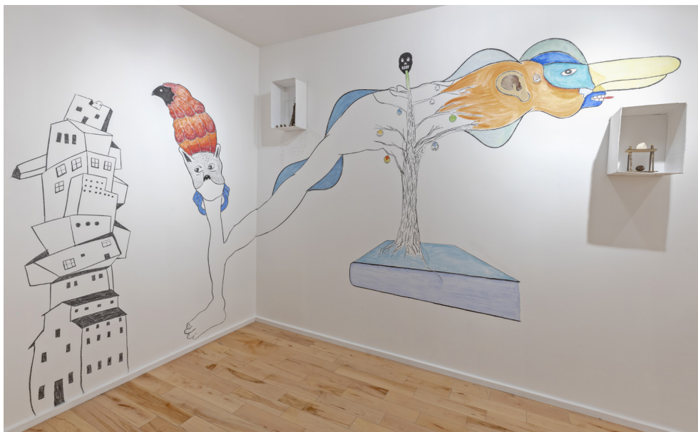
Image: Z'otz* Collective, detail from mural Dissolving Frontiers , dimensions variable, 2019.