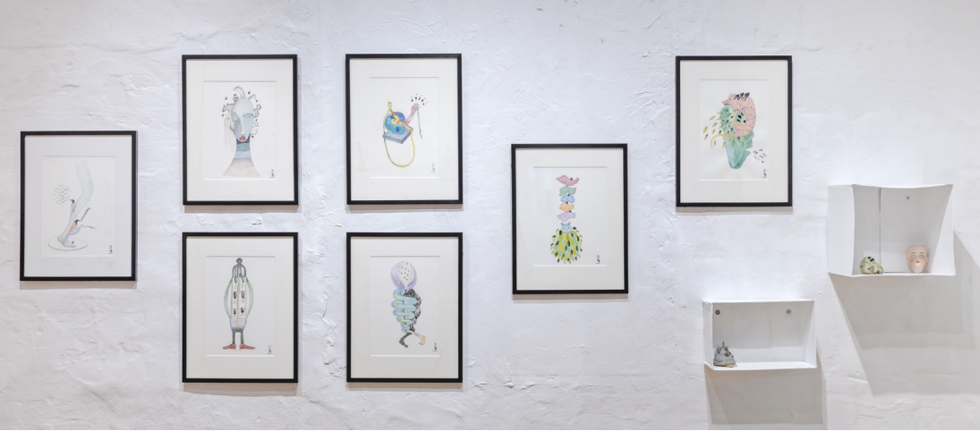
Image: Z'otz* Collective, After Reading the Book Twice (series), mixed media on paper, 11 x 15 cm, 2019.

Waiting Outside of My Hand introduces VAC's visitors to a body of work that is visceral and open-ended. Z'otz* Collective's collaboration is ingrained in their practice and carried out through every medium they explore. Their work conveys an intuitive energy, resulting in enigmatic images that allow individual interpretations. In keeping with their collaborative approach, the exhibition ends with an opportunity for visitors to add to the story. Empty niches in a series are placed next to objects collected from the VAC, prompting visitors to experiment by using the found objects to create their own niches. In doing so, they explore potential narratives and themes that arise when objects are recontextualized. Waiting Outside of My Hand invites visitors to become the decoders of Z'otz* Collective's iconography, and contributors to their stories. In doing so, we interpret, project and self-reflect, adding to the complexity of their narrative and ours.