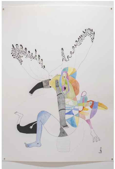
Images: Z'otz* Collective, (left) detail from mural Dissolving Frontiers , dimensions variable, 2019, (right) Z'otz* Collective, Distracted Perfections (excerpt from series), 2019, mixed media on paper, sizes variable, 2012 - 2019.